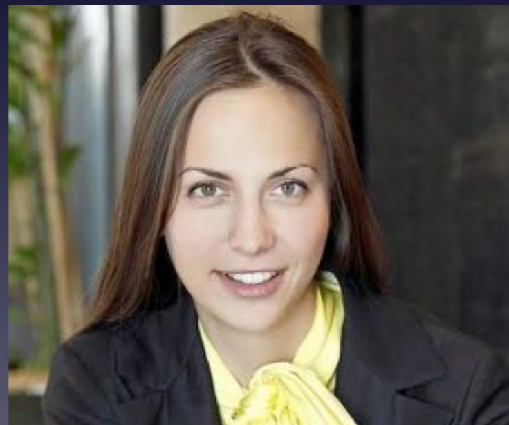
Eva Maydell, Member of European Parliament