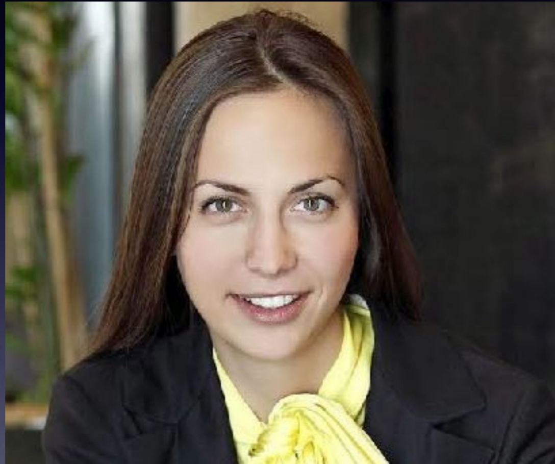
Eva Maydell, Member of The European Parliament